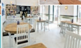
Open daily from 9.30 for tea, coffee & breakfast