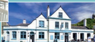
Independently owned and family run