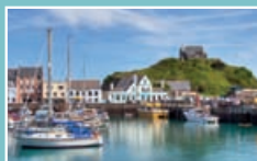
Views of Verity and the harbour from our outside seating area