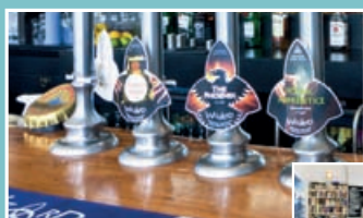
Home of the Wizard Brewing Co.