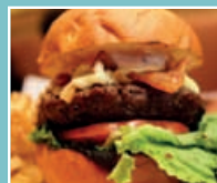
Farm (or boat) to plate from our all day grill menu