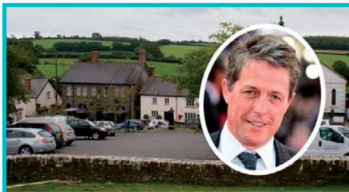
Did anyone spot Hugh Grant visiting our Pub of the Year?